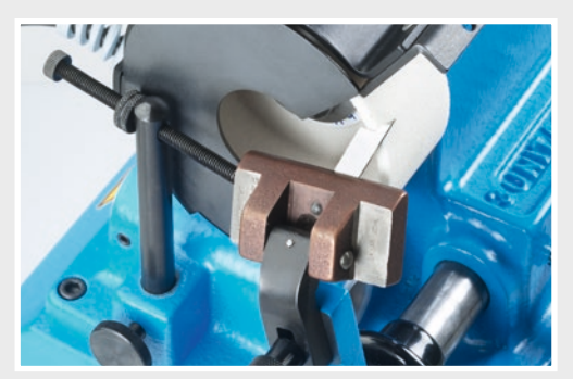
Knife with tip