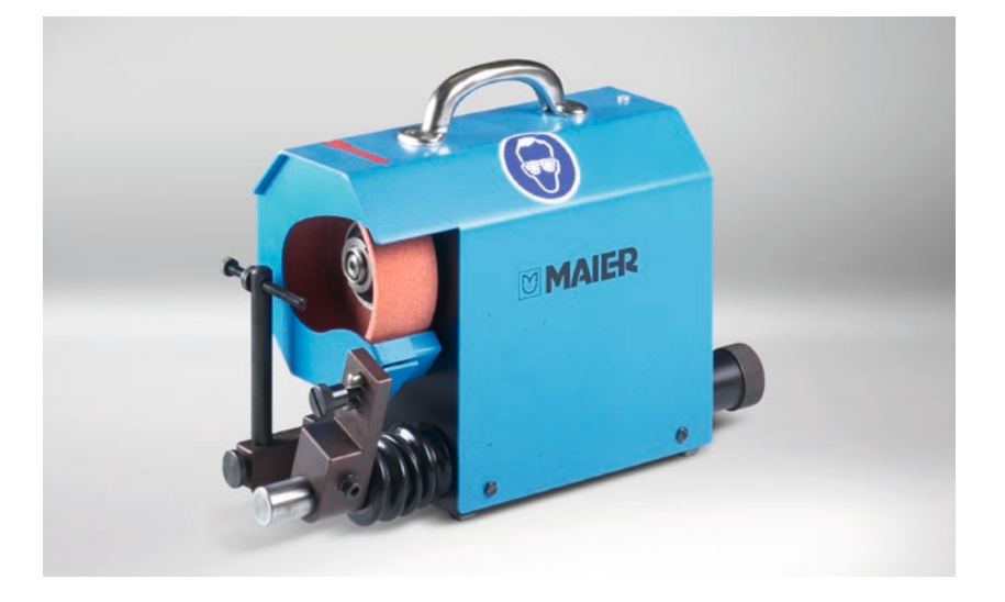
Specifications: Motor: 230 V, 50 Hz, 0.15 kW, 2710 rpm (On request: 115 V, 60 Hz, 0.15 kW, 3350 rpm)