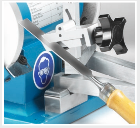
Tensioning device for burring chisel M/111.40