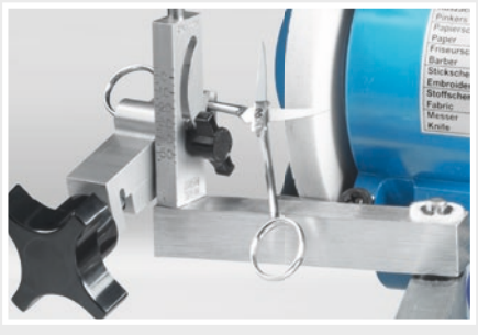
Grinding buttonhole scissors