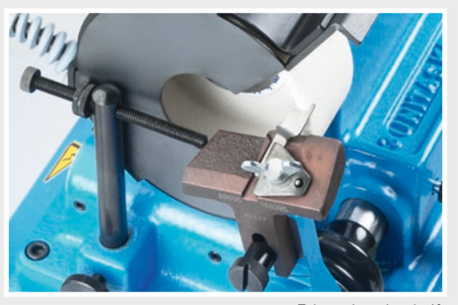
Edge trimming knife