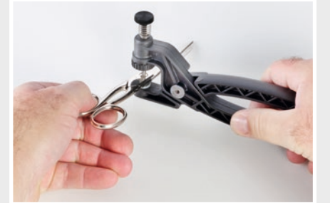
Pliers for setting the tensioning screw M/111.41