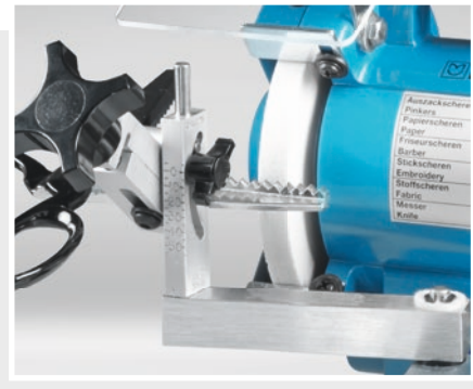
Grinding pinking scissors