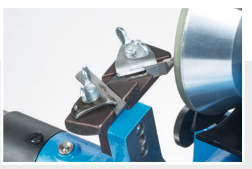
Carbide-tipped knife with diamond grinding wheel