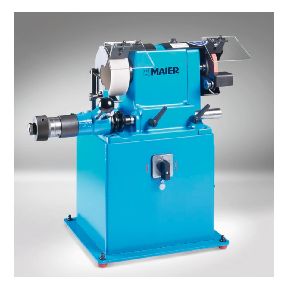
Specifications: Grinding spindle rotation speed 4500 rpm Motor: 400 V, 50 Hz, 0.25 kW (on request: 230 V, 50 Hz, 0.25 kW or 115 V, 60 Hz, 0.24 kW)